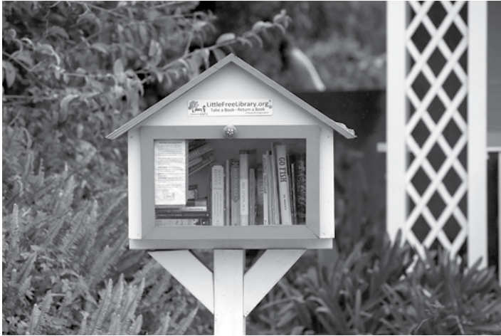
3450 Rose Avenue

Have you seen any of the wonderful local pop up libraries? Leave a book, take a book, and spend the afternoon reading!