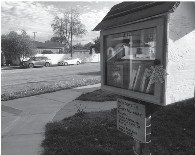
3654 Rose Avenue