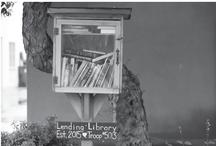
United Methodist Church by the Children's Center on Bixby and Orange