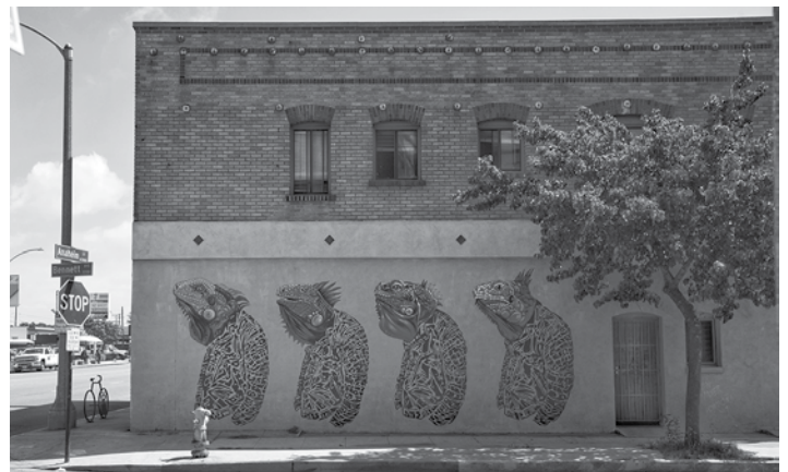
Zaferia Neighborhood

For October, "This is Long Beach" is highlighting the Cal Heights neighborhood. We'll be interviewing community leaders, business owners, and local residents to share stories from the community with everyone. The episode will air on KLBP 99.1 on Saturday, October 5 at 10AM, right before the Cal Heights Home and Garden Tour. Listen live on the radio or stream us at http://www.klbp.org . ✿