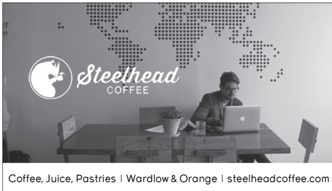
Coffee, Juice, Pastries | Wardlow & Orange | steelheadcoffee.com

Located in Cal Heights - License #886957