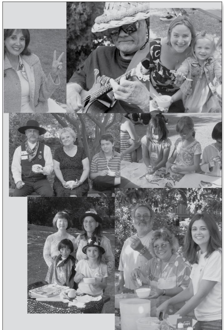
(Photos by Kent Lockart. View more pictures at facebook.com search on California Heights Neighborhood Association.)