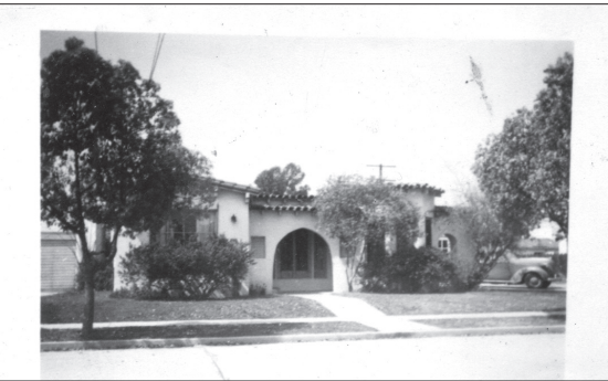
Estrella Residence on Olive Avenue circa 1930s