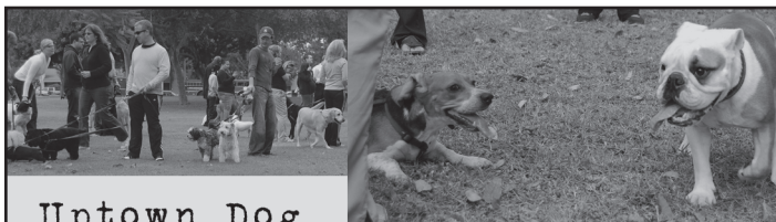
Uptown Dog Park @ Scherer Park (4600 Long Beach Boulevard)

We wish you a safe and happy holiday season. ❀