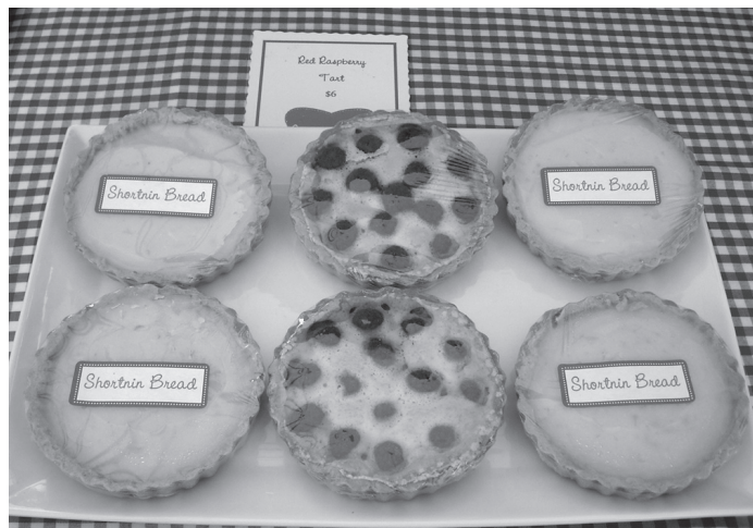
Shortnin Bread's Red Raspberry Tarts!

I do enjoy the restaurant at breakfast time. The specials are truly good and the wait is well worth it. The muffins make my mouth water. Bake n Broil is homey, charming and family friendly with a child's menu. I am sure you have been there, but if not give them a try. Bake N Broil - 3697 Atlantic Ave., 595-0396. *