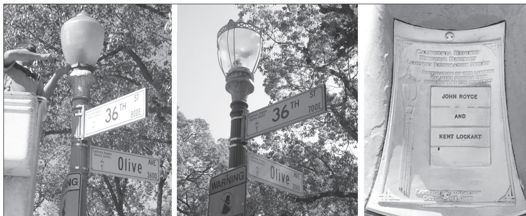
Lamppost on 36 th and Olive being restored and sample plaque.

The Heights is a bimonthly publication of the California Heights Neighborhood Association. All residents are invited to contribute articles and opinions. We reserve the right to edit for clarity and brevity. Opinions expressed are not necessarily shared by all residents nor the editor. Our goal is to provide a voice to our community and keep residents informed of issues affecting California Heights.