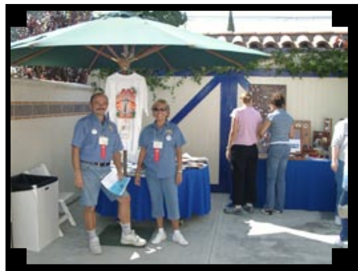
Be3B Hardware's booth at the 2004 Home Tour.