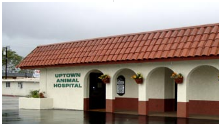
Uptown Animal Hospital at 3350 Atlantic Ave.

A little bit about myself: I was born in Taipei, Taiwan, and grew up in different parts of the world including Singapore, Hong Kong,