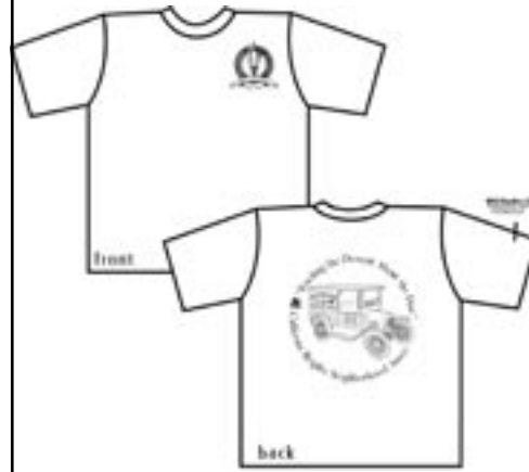
Green T-Shirt w/yellow print