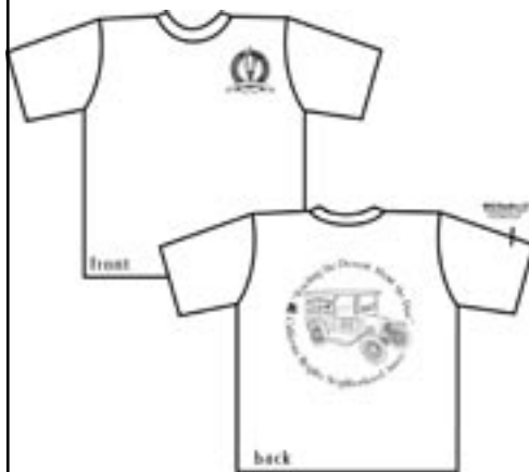
Green T-Shirt w/yellow print