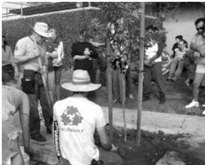
The Tree People demonstrate proper tree care when planting new trees in the area

Two significant tree events recently took place in our area.