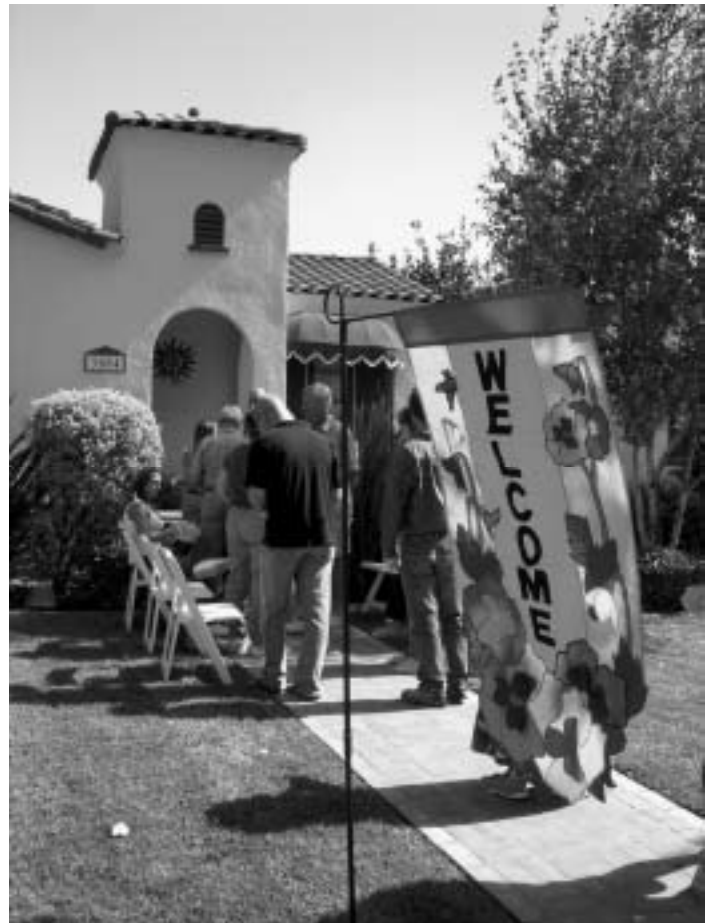
The Home & Garden Tour showcases the best of Cal Heights