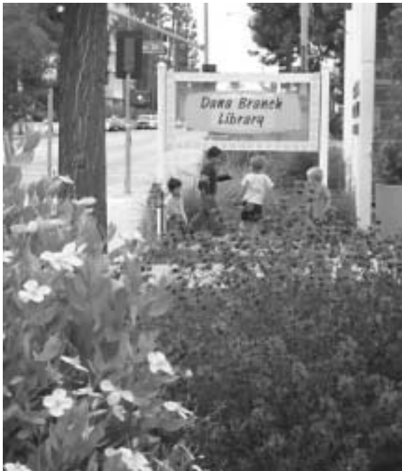
The new and improved Dana Branch Library looks even better in color. Be sure to visit this summer and check out a few books, DVDs or just donate some of your old books and media.